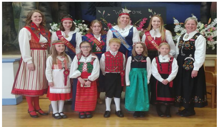
2019 Scandinavian Court Visit