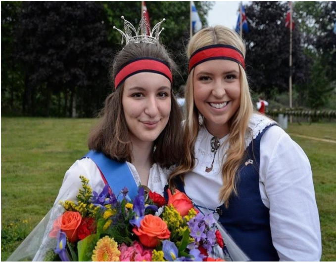
2019 Miss Finland Tea